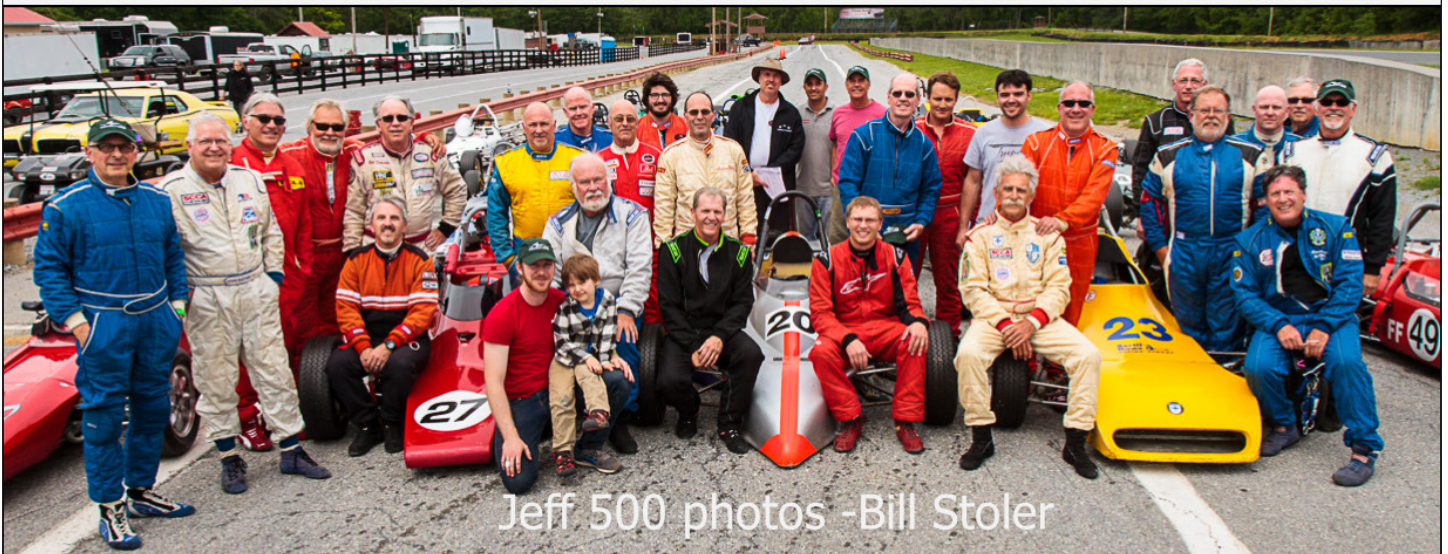
Jeff 500 photos -Bill Stoler