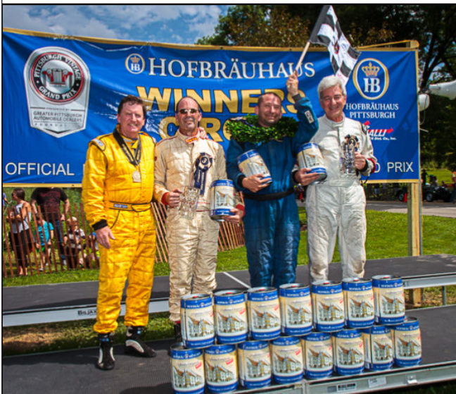
2017 PVGP