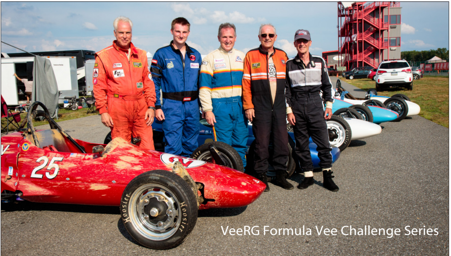
VeeRG Formula Vee Challenge Series